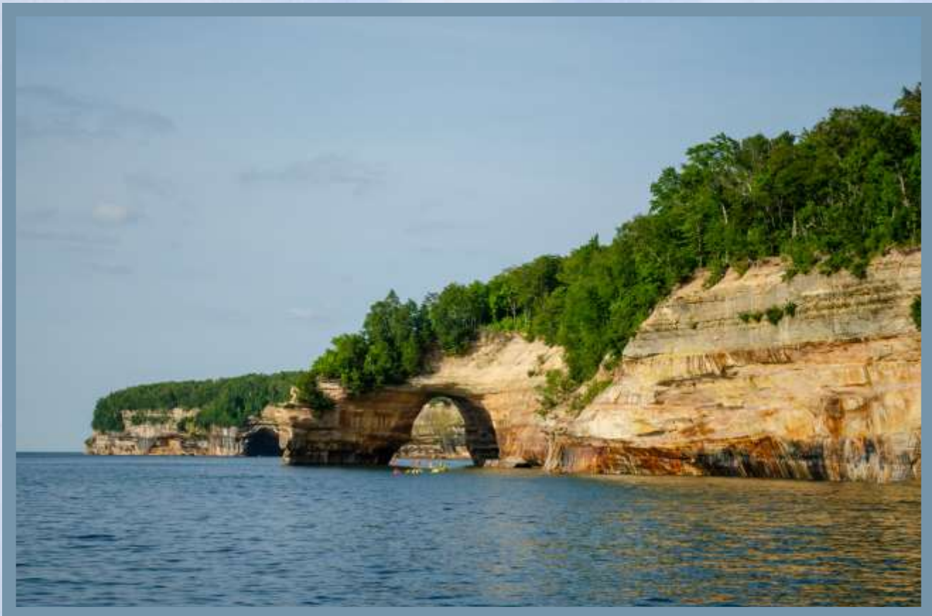
Lake Superior, Michigan

Please welcome her at your next ZOOM opportunity!