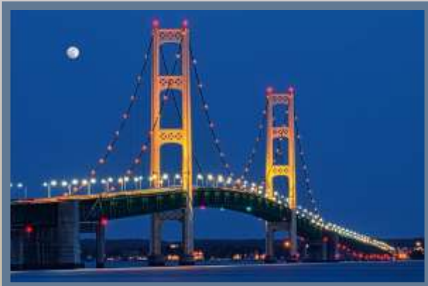
SLIDE SHOW (Ctrl-Click image) Glen Petranek, Images