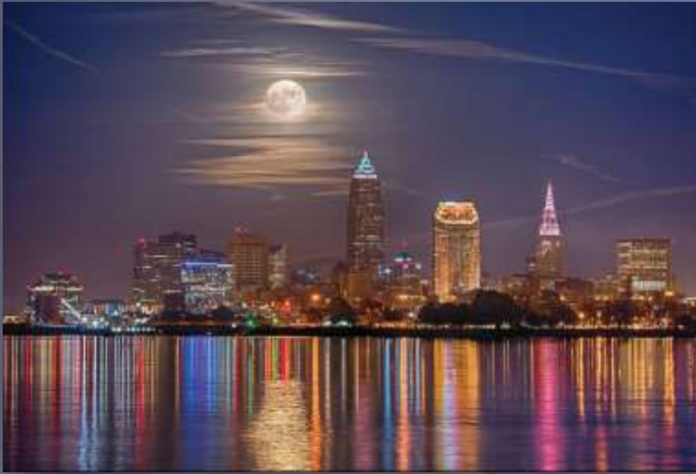
© Glenn Petranek, Moon rise Over Cleveland reflected in a glass like Lake

Wednesday, November 2, 2022, 7PM Glen Petranek, On the Road Again